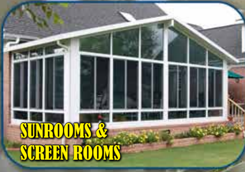
SUNROOMS & SCREEN ROOMS