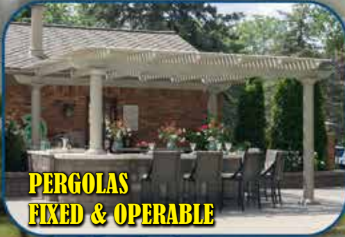
PERGOLAS FIXED & OPERABLE