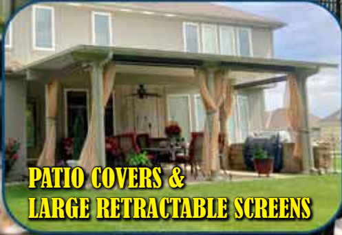
PATIO COVERS & LARGE RETRACTABLE SCREENS