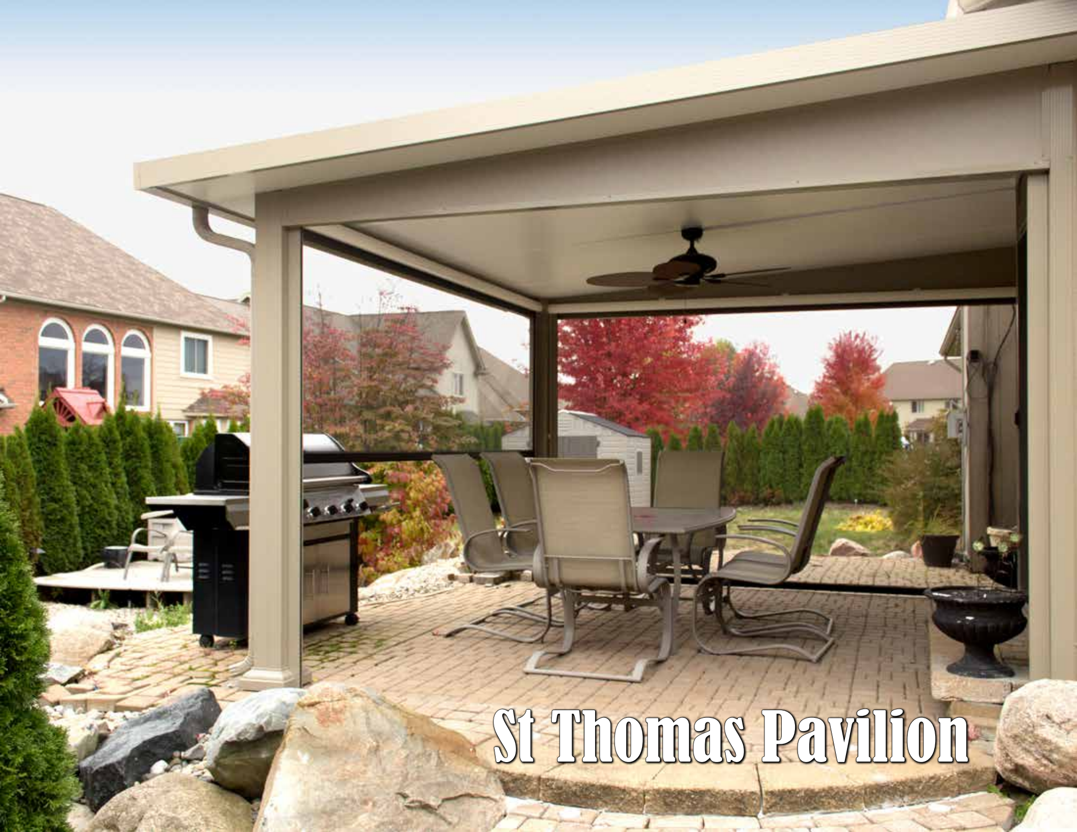
St Thomas Pavilion